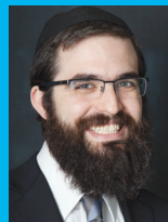
Rabbi Moshe Tzvi Weinberg