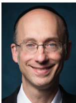
Rabbi Zvi Sobolofsky