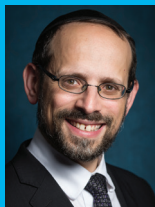
Rabbi Yaakov Werblowsky