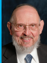
Rabbi Yosef Blau