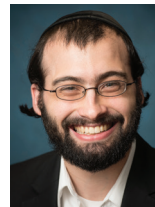
Rabbi Ariel Diamond