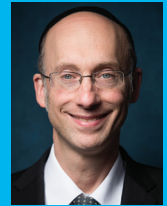
Rabbi Zvi Sobolofsky