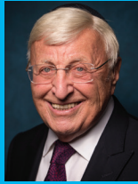
Rabbi Benjamin Blech